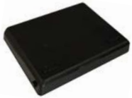
SB01 4500mAh Battery