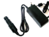
VC01 Vehicle Charger

◆ Input : 10 - 32V, 11A Max ◆ Output : 18.5V (18.5V), 4.9A 90W