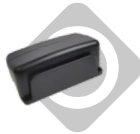
MSR + Barcode Scanner